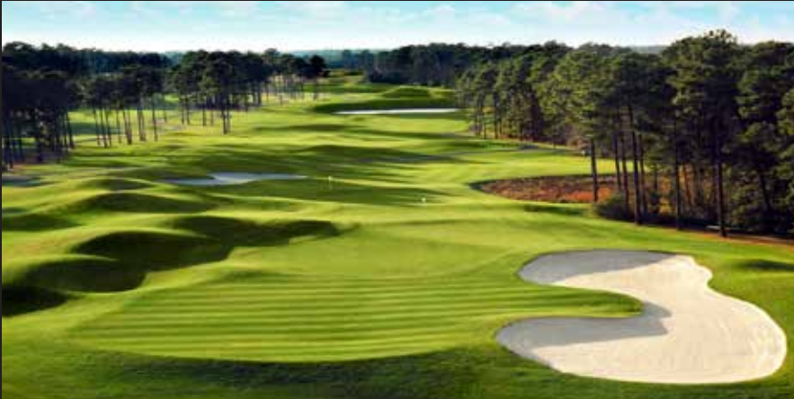
9 HOLE ORGANIC GOLF COURSE