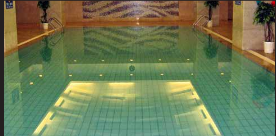
INDOOR HEATED POOL