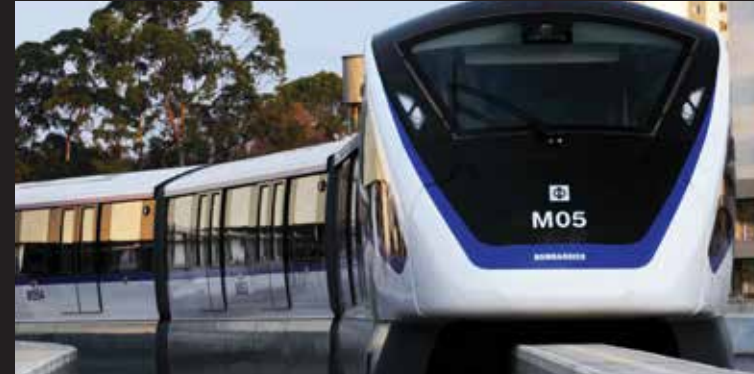
CLOSE PROXIMITY FROM UPCOMING ALPHA II - METRO STATION