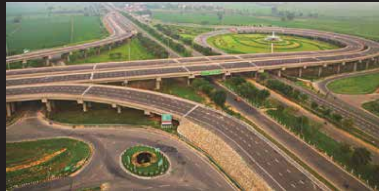
CONNECTED WITH 3 MAJOR EXPRESSWAYS TAJ EX, NOIDA-GR NOIDA EX, FNG EX