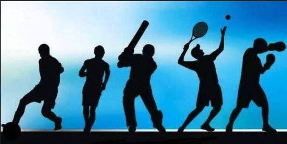
SPORTS ACADEMY BY TENVIC