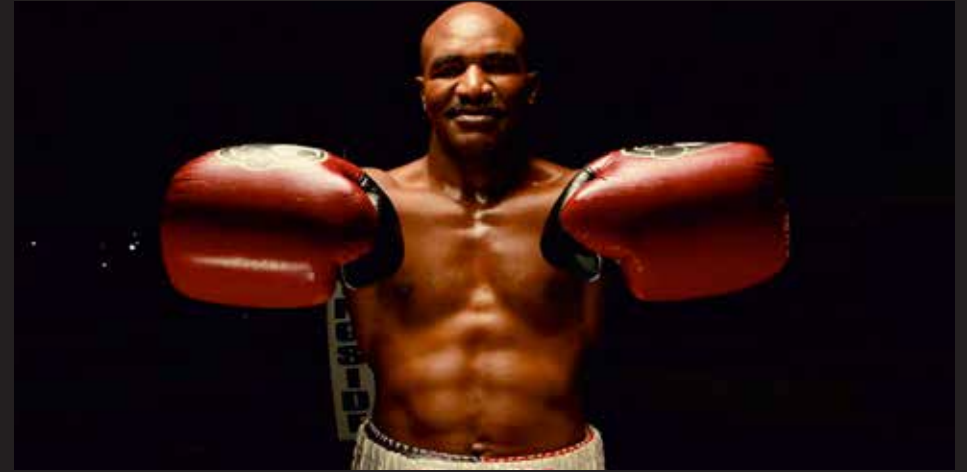
GYMNASIUM BY HOLYFIELD GYMS