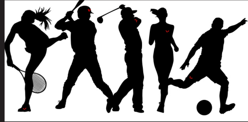
STATE-OF-THE ART SPORTS ARENA