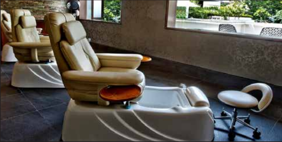
SPA & SALON BY WARREN TRICOMI