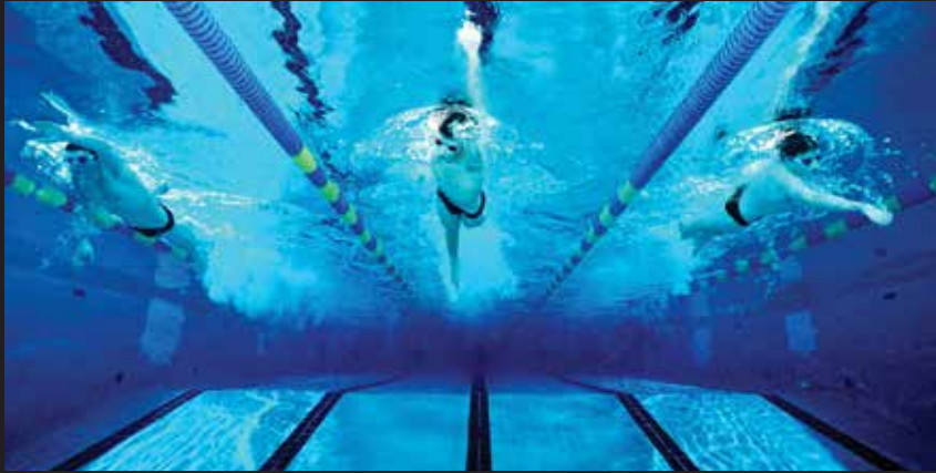
OLYMPIC SIZE SWIMMING POOL