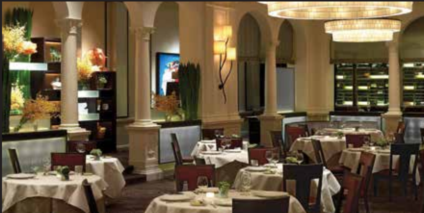
FINE DINING RESTAURANT