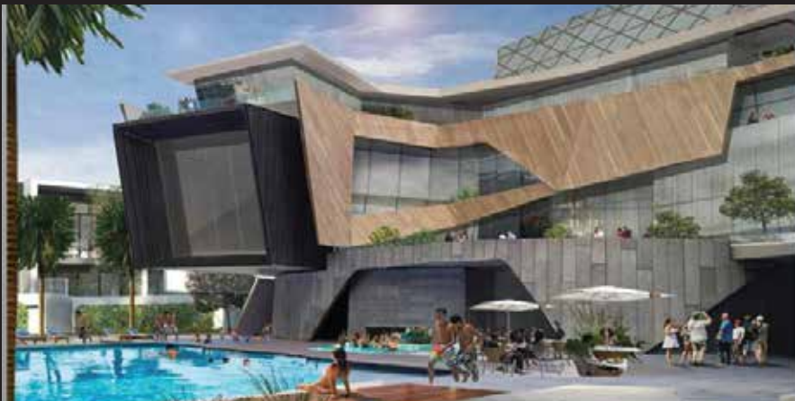
EXPANSIVE GOLF CLUB