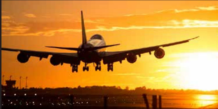
CLOSE PROXIMITY TO UPCOMING INTERNATIONAL AIRPORT