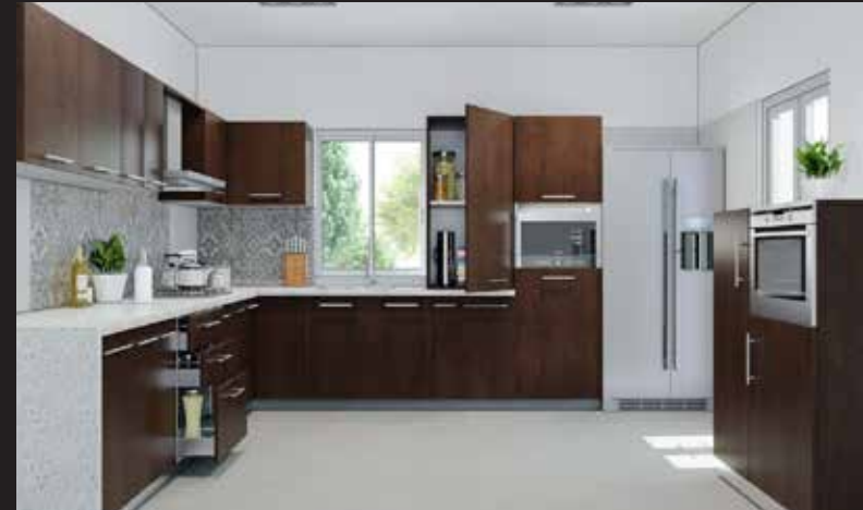
DESIGNER KITCHEN WITH BUILT IN APPLIANCES