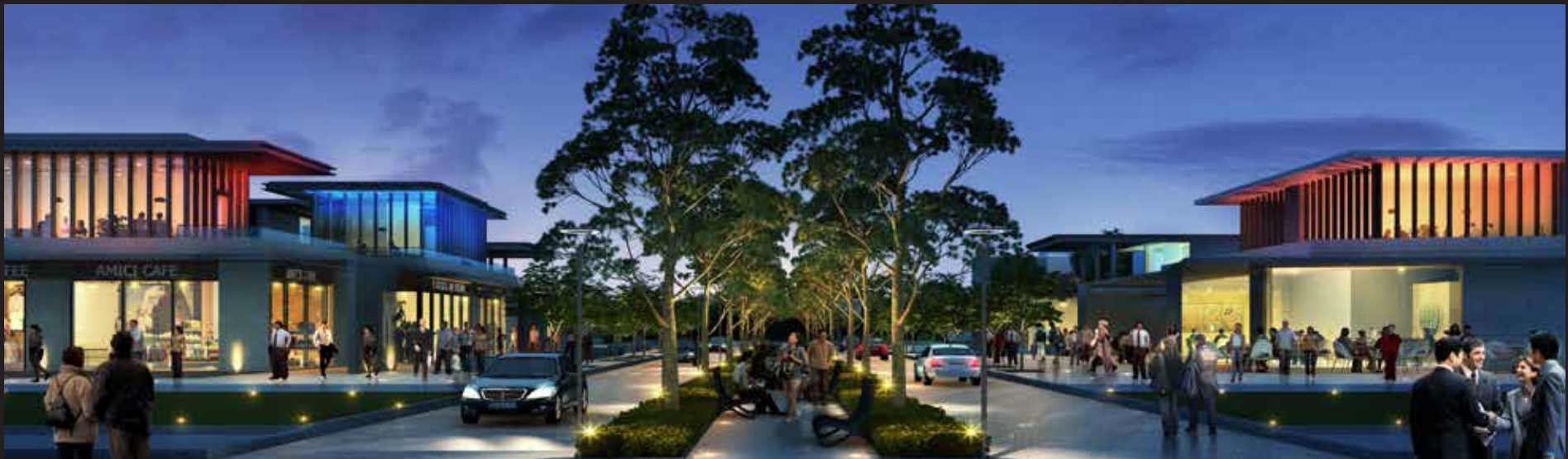
HIGH STREET RETAIL