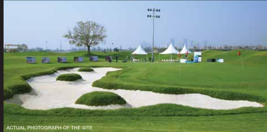
ACTUAL PHOTOGRAPH OF THE SITE