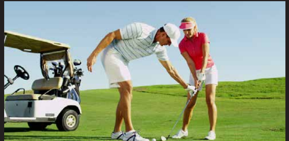
GOLF ACADEMY BY GOLFING NATION