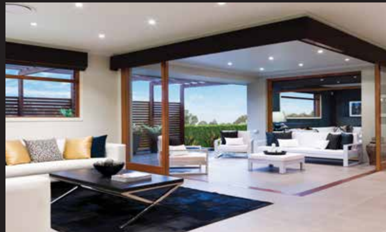
AIR CONDITIONED VILLAS