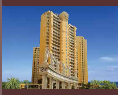
PURVANCHAL ROYAL CITY PHASE I Sector CHI-V, Greater Noida