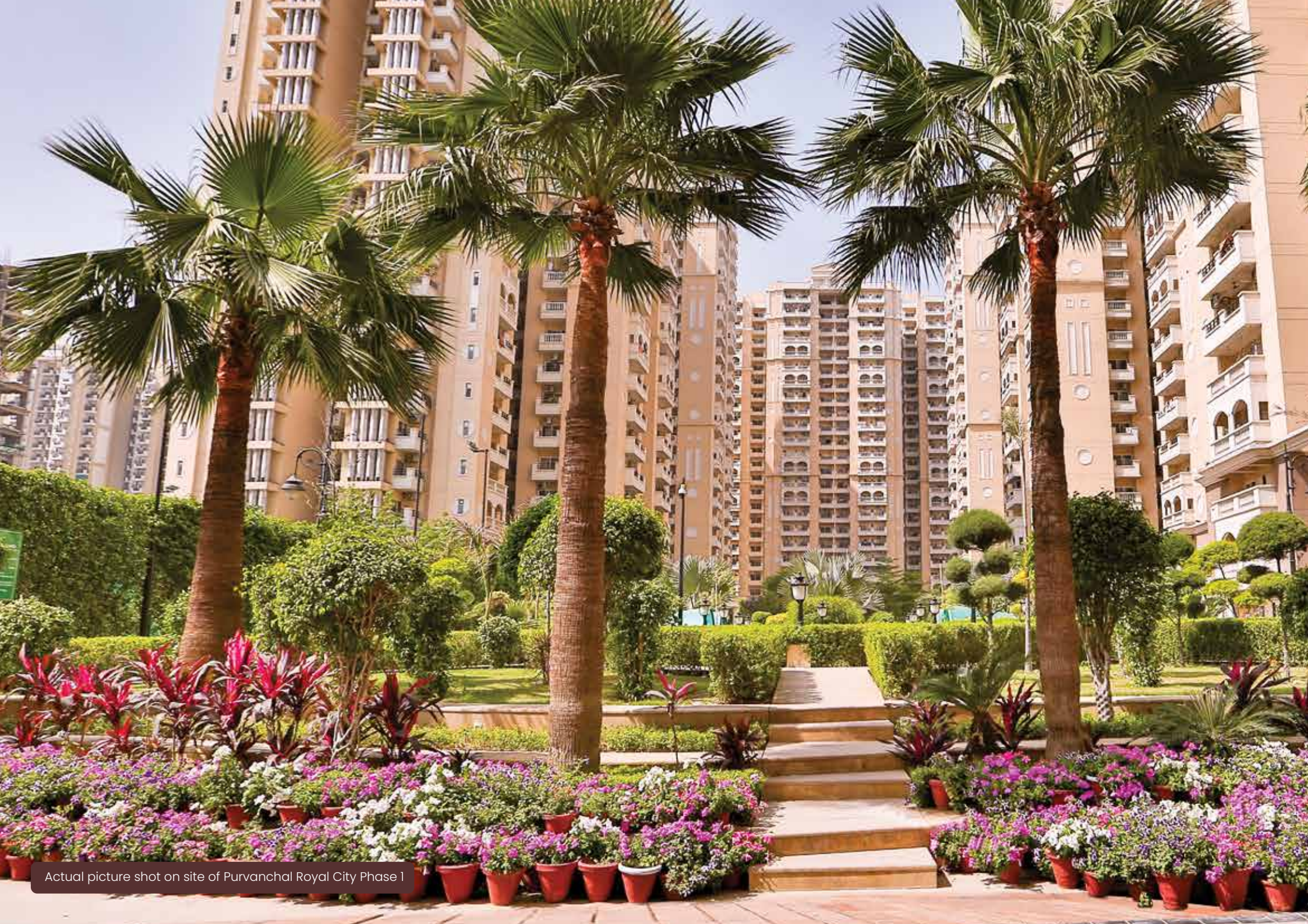
Actual picture shot on site of Purvanchal Royal City Phase 1