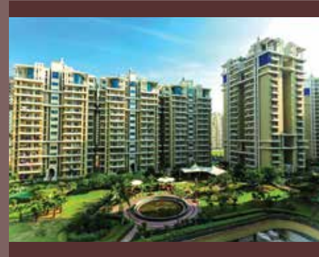
PURVANCHAL ROYAL PARK Sector-137, Noida