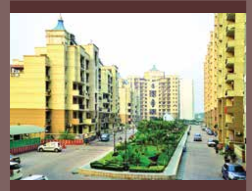
PURVANCHAL HEIGHTS Sector-Zeta 01, Greater Noida