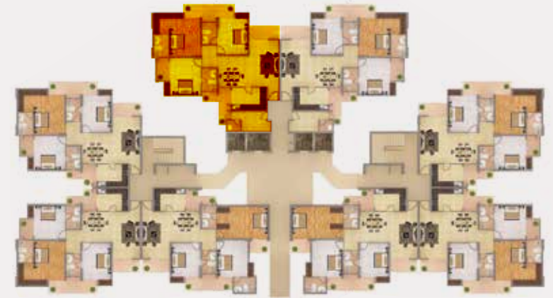
UNIT ORIENTATION AS PER TYPICAL FLOOR PLAN