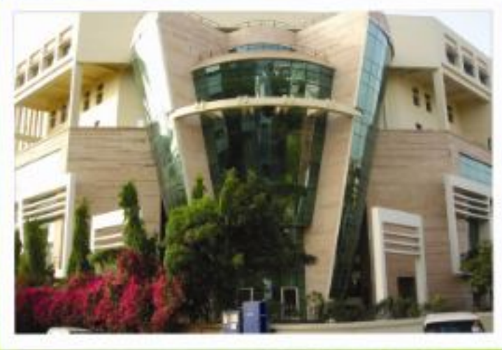
WIPRO TECHNOLOGIES, GURGAON PLATINUM RATED LEED CERTIFIED GREEN BUILDING - 2005