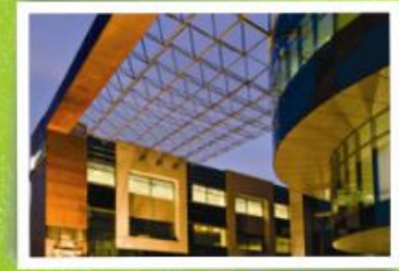
PATNI KNOWLEDGE CENTER, NOIDA (BLOCK B) GOLD RATED LEED CERTIFIED GREEN BUILDING - 2011