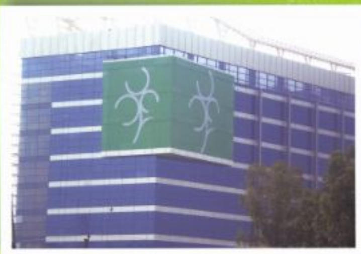
KNOWLEDGE BOULEVARD, NOIDA