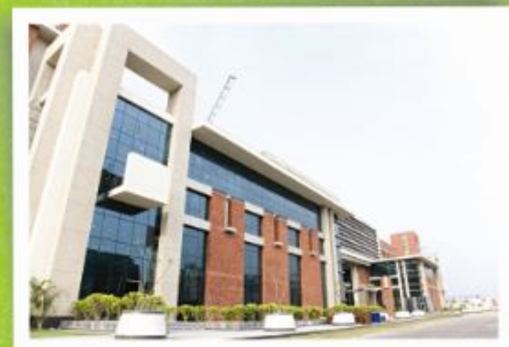
CSC CAMPUS, NOIDA