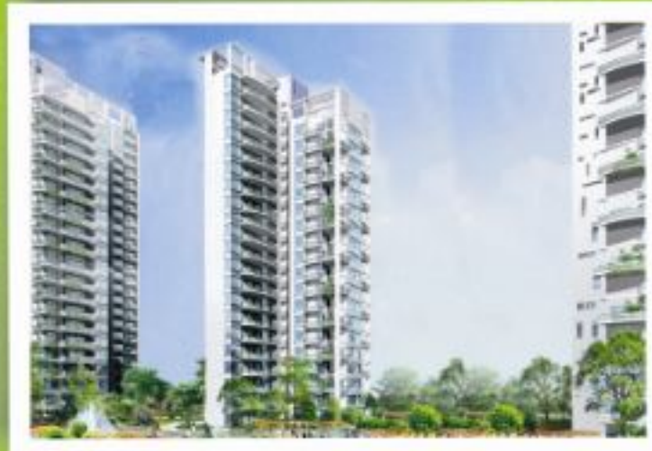
LOTUS BOULEVARD ESPACIA, NOIDA