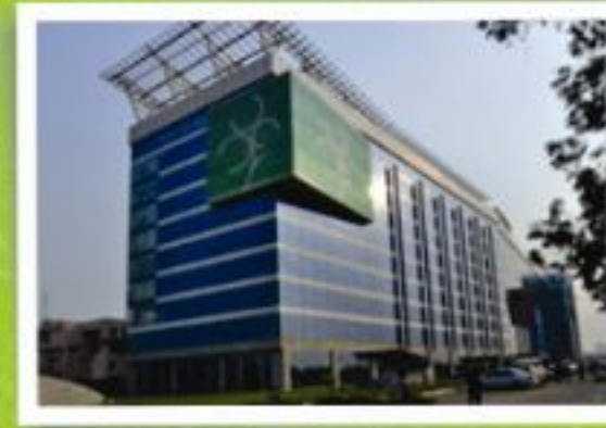
KNOWLEDGE BOULEVARD, NOIDA GOLD RATED LEED CERTIFIED GREEN BUILDING - 2011