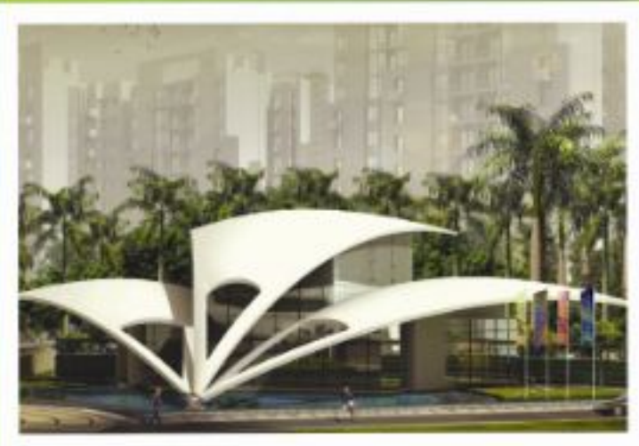
LOTUS BOULEVARD, NOIDA