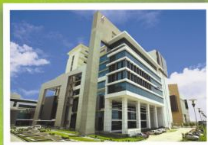
TECH BOULEVARD, NOIDA