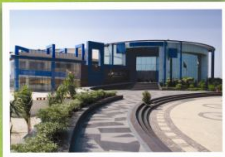
LOTUS VALLEY INTERNATIONAL SCHOOL, NOIDA