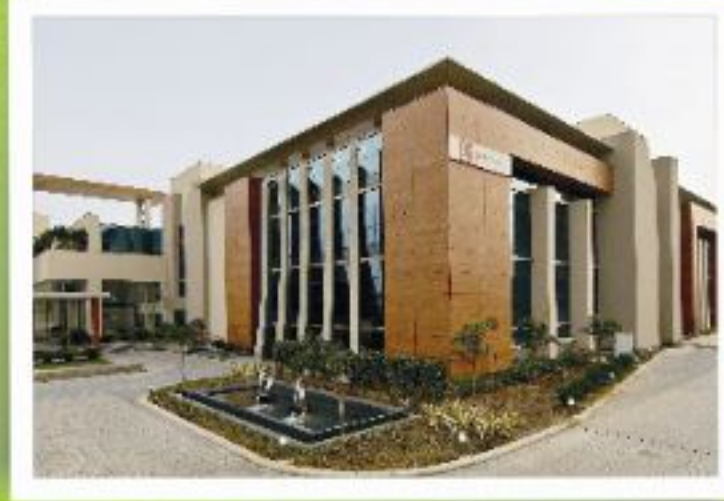
PATNI KNOWLEDGE CENTRE, NOIDA (BLOCK A) PLATINUM RATED LEED CERTIFIED GREEN BUILDING - 2008