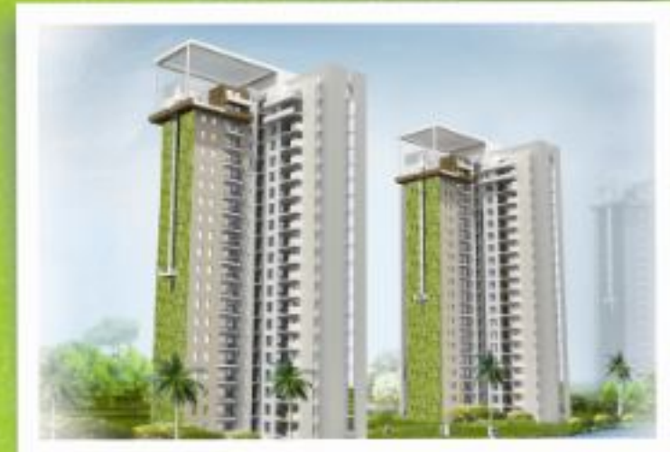
LOTUS PANACHE, NOIDA