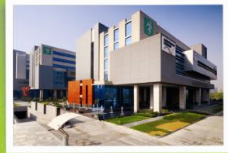
GREEN BOULEVARD, NOIDA PLATINUM RATED LEED CERTIFIED GREEN BUILDING - 2009