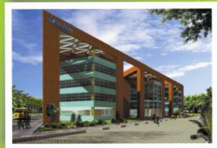
LOTUS VALLEY INTERNATIONAL SCHOOL, GURGAON

Note: Buildings get LEED rating only after they are operational.