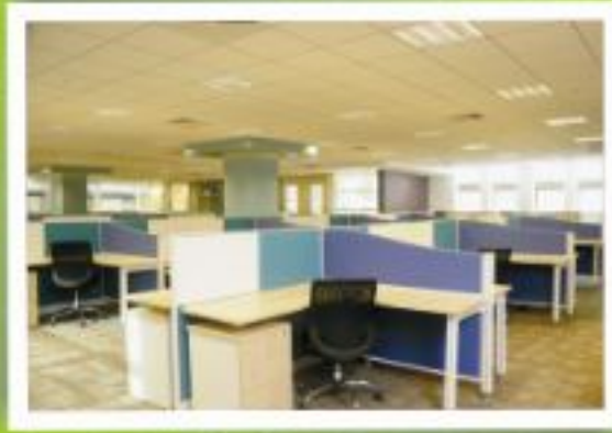
SPECTRAL SERVICES, HYDERABAD GOLD RATED LEED CERTIFIED GREEN BUILDING - 2009