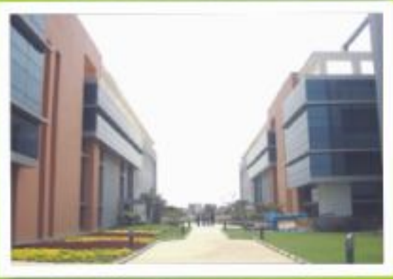
WIPRO TECHNOLOGIES, GREATER NOIDA GOLD RATED LEED CERTIFIED GREEN BUILDING - 2009