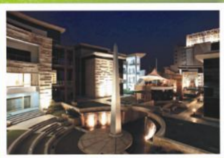
INTERNATIONAL HOME DECO PARK, NOIDA