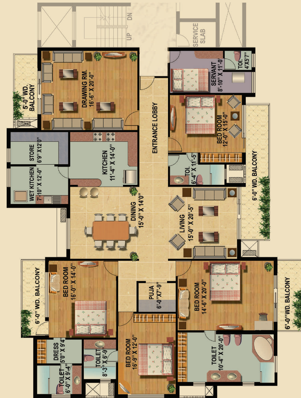
Super Area = 4150 Sq. Ft