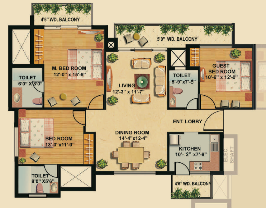
Super Area = 1800 Sq. Ft