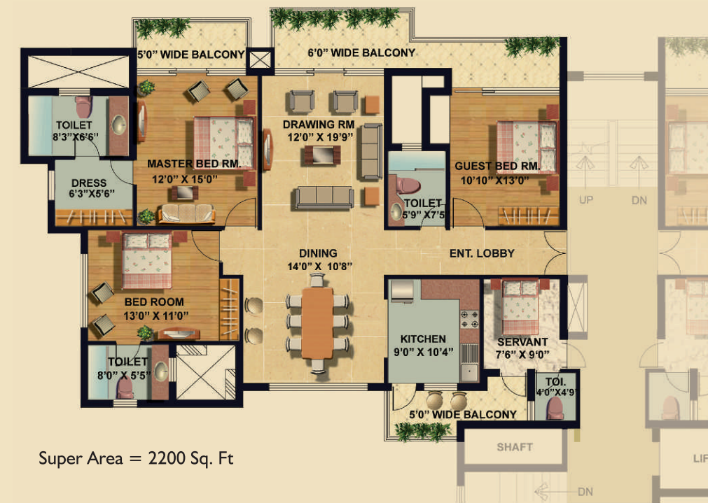
Super Area = 2200 Sq. Ft