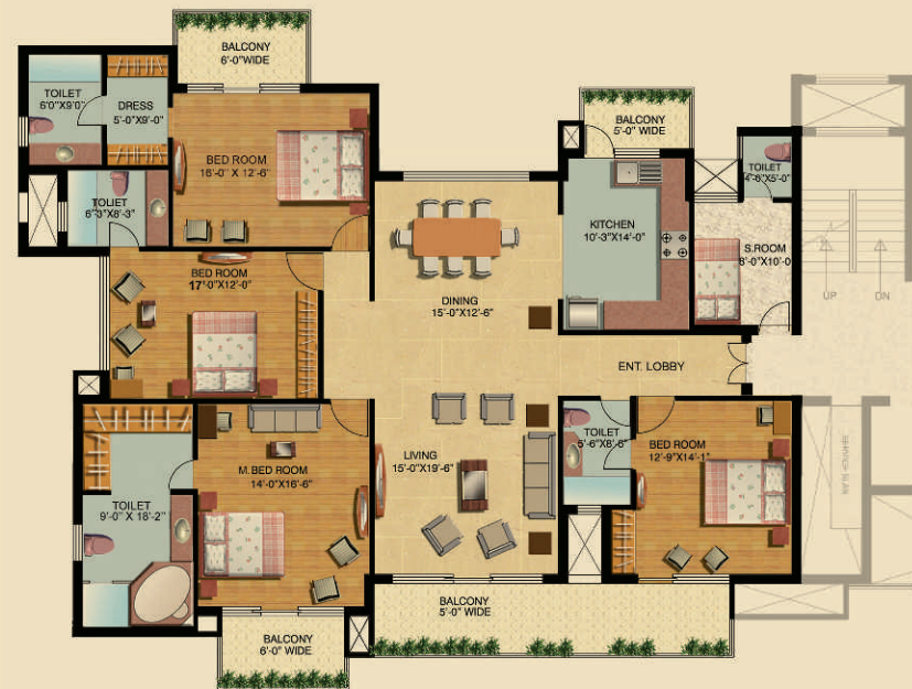
Super Area = 3200 Sq. Ft